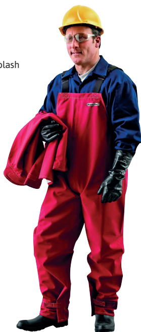
AlphaTec™ Bib Overall, made of Gore® Chemical Splash fabric, Polyester version. 66-662.

AlphaTec™ is not just any workwear. It is protective clothing for industrial everyday work. Workwear combining outstanding comfort with advanced chemical protective properties.