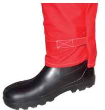
Ankle hook and loop closure