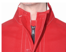
Double front flap hook and loop closure