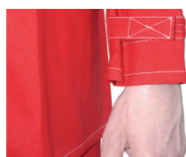
Wrist hook and loop closure

The sizes of the clothing are indicated by letters S-XXXL. Measurements are taken on the product and reflect real product size. Customized sizes are available upon request. Please call customer service for details.