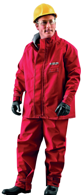
AlphaTec™ Jacket, made of Gore® Chemical Splash fabric, Polyester version. 66-660.

BREATHABLE CHEMICAL PROTECTION: JACKET 66-660 | BIB OVERALL 66-662