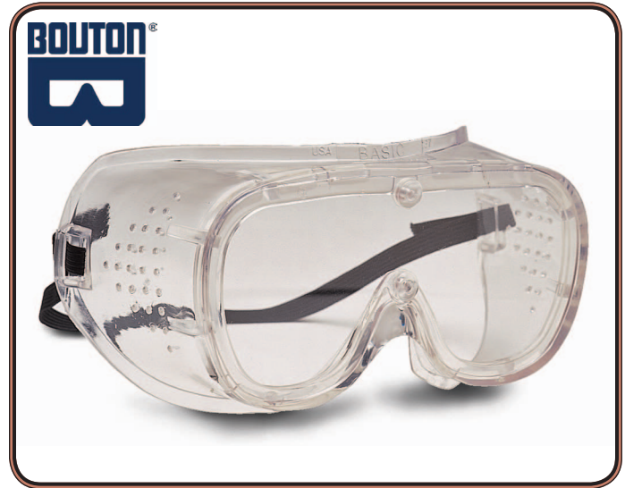
Polycarbonate lenses block 99.9% of the sun's ultraviolet rays. This ultraviolet protection has already been incorporated within the lens material when the lenses are being produced.