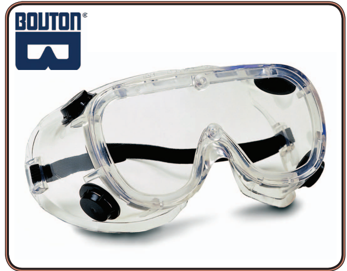
Polycarbonate lenses block 99.9% of the sun's ultraviolet rays. This ultraviolet protection has already been incorporated within the lens material when the lenses are being produced.