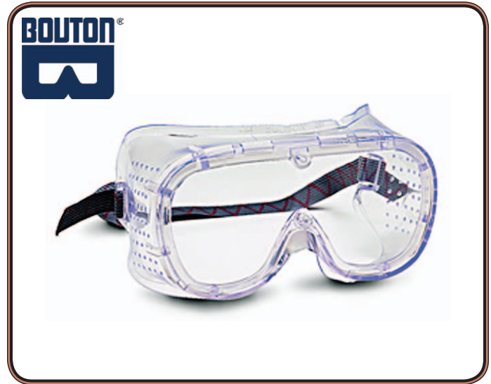
Polycarbonate lenses block 99.9% of the sun's ultraviolet rays. This ultraviolet protection has already been incorporated within the lens material when the lenses are being produced.

Color: Clear Blue Transparent to prevent yellowing