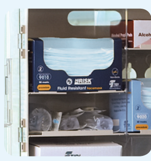
Customized packaging allows for easy top and front access when stored in cabinets, shelves, and drawers.