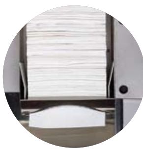
SCOTTFOLD* Towels can't be loaded incorrectly