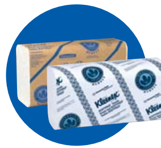
Look, feel and performance, all folded into one